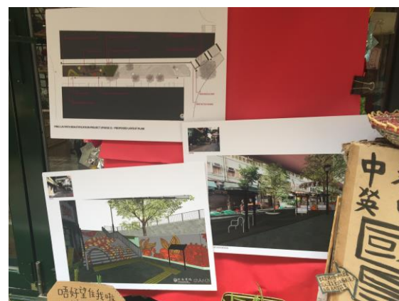
Figure 3 The bulletin board outside Kung Yung Koon also shows an ideal outcome of the revitalization project.

As a reaction to this rejection, Koon Yoon Koon decided to organize activities in Ping Lai Path with high flexibility and mobility to avoid the government's interference. For instance, a mobile pop-up library is set up outside Kung Yung Koon for ethnic minority students to gather and read after school