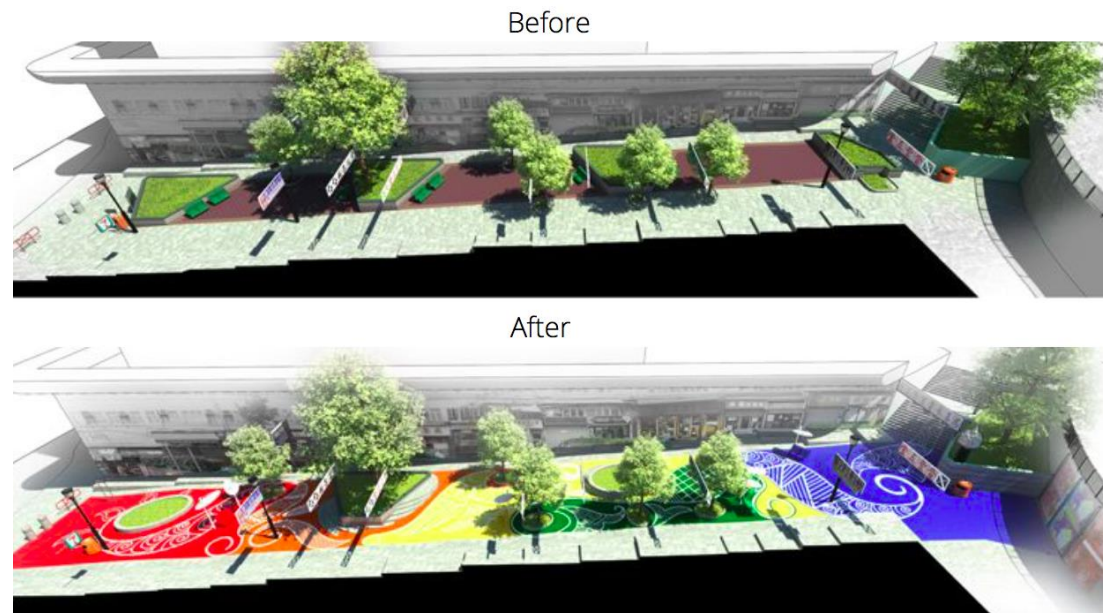
Figure 2 A visualization of Kung Yung Koon's district revitalization project. As seen from the picture, the organization could only make alterations to the ground design.

government that imposed more obstacles for Kung Yung Koon during the implementation of the project, since they had to discuss and bargain with nearly seven government departments separately (Kung Yung Koon; Appendix 2).